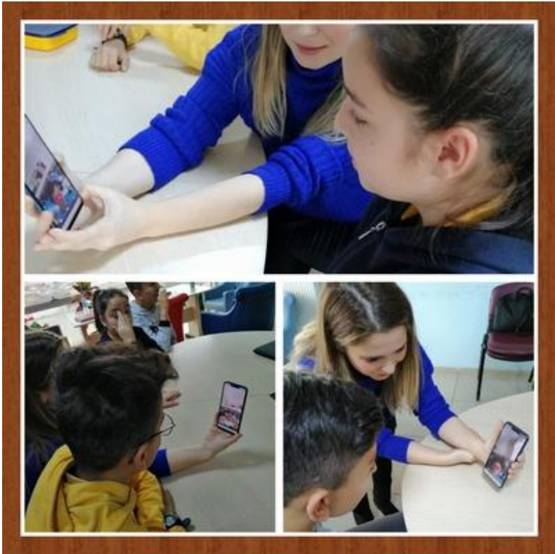
*STUDENTS TALKED WITH OTHER SCHOOL PARTNERS ON THE TELEPHONE FOR 8TH GRADE UNIT 4 TELEPHONE.